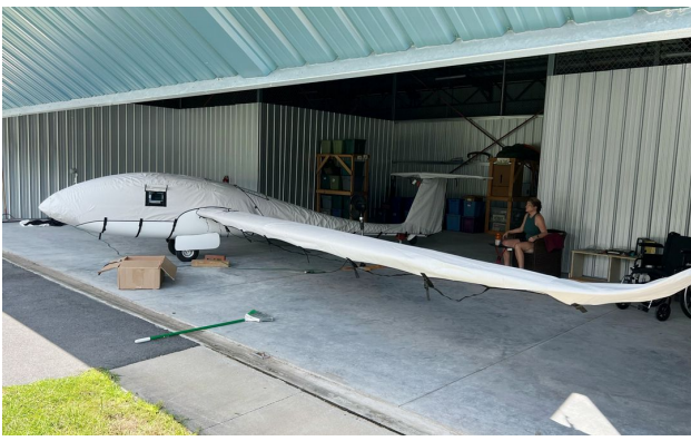
Pipistrel Taurus Complete Cover Set