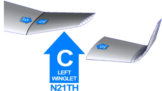
Sailplane Full Cover Set Graphic Indicators (Discus 2B, 3D model)