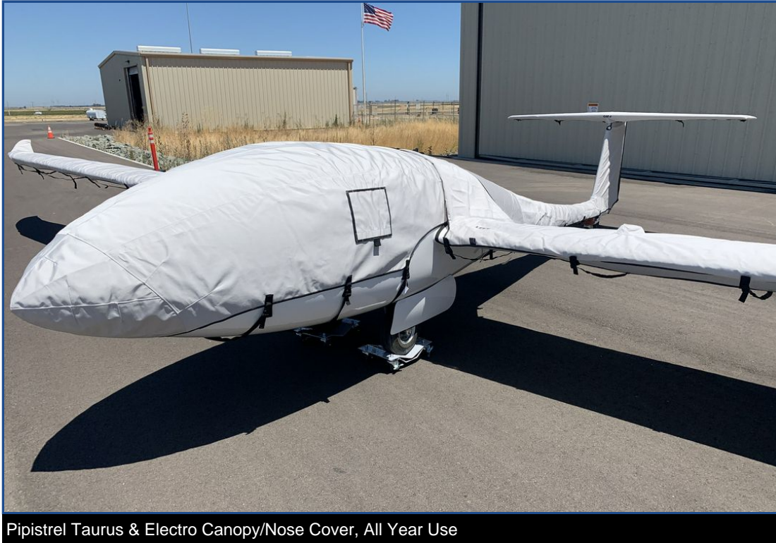
Pipistrel Taurus &amp; Electro Canopy/Nose Cover, All Year Use