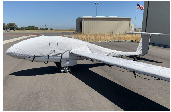
DG-505 Canopy/Nose, Wing, Empennage & Horiz. Stab. Covers Pipistrel Taurus & Electro Canopy/Nose Cover, All Year Use