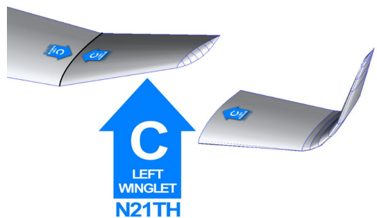
Sailplane Full Cover Set Graphic Indicators (Discus 2B, 3D model)