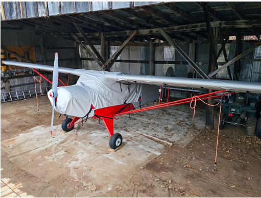
Taylorcraft BC12-D Canopy Cover, Over Top Type

This cover type is made from Silver Acrylic Sunbrella canvas and is 100% lined with a soft and smooth microfiber. Bruce's Custom Covers developed this material combination especially for aircraft protection. The outer material is medium weight and treated for water resistance, UV resistance and anti-static buildup. The inner lining is a very soft and smooth microfiber to prevent scratching. The material is very reflective, and tests show that the cabin interior temperature can be reduced to near-ambient temperature on the hottest of days. It is water, ice and snow repellent, yet breathable to allow moisture to escape from between the cover and the aircraft surface.