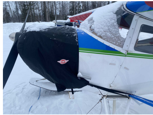
Taylorcraft Insulated Engine Cover