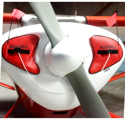
Taylorcraft Engine Inlet Plugs