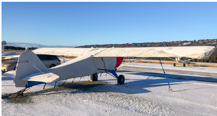
Taylorcraft Aviation Corp F19 Wing Covers