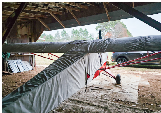
Taylorcraft BC12-D Empennage Cover (Tailboom, Vertical & Horiz Stabilizers) All Year Use

WINTER USE MATERIAL - Made with Solution-Dyed Polyester fabric, this option is intended for seasonal use to aid in deicing, rain mitigation, or for occasional travel. The material is lighter and more compact, but more susceptible to UV damage and may have a shorter useful life if used continuously outside than the all-year use material.