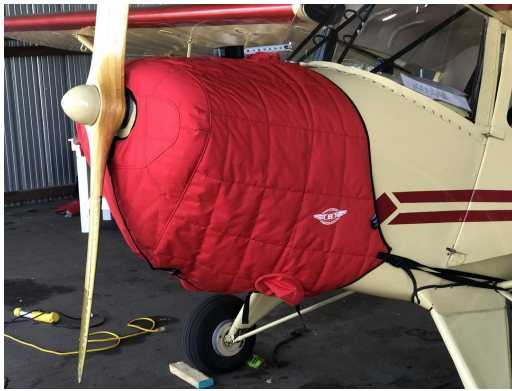
Taylorcraft Insulated Engine Cover

This cover type is made from Silver Acrylic Sunbrella canvas and is 100% lined with a soft and smooth microfiber. Bruce's Custom Covers developed this material combination especially for aircraft protection. The outer material is medium weight and treated for water resistance, UV resistance and anti-static buildup. The inner lining is a very soft and smooth microfiber to prevent scratching. The material is very reflective, and tests show that the cabin interior temperature can be reduced to near-ambient temperature on the hottest of days. It is water, ice and snow repellent, yet breathable to allow moisture to escape from between the cover and the aircraft surface.