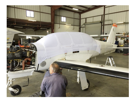
Socata TB30 Epsilon Canopy Cover, test fit cover