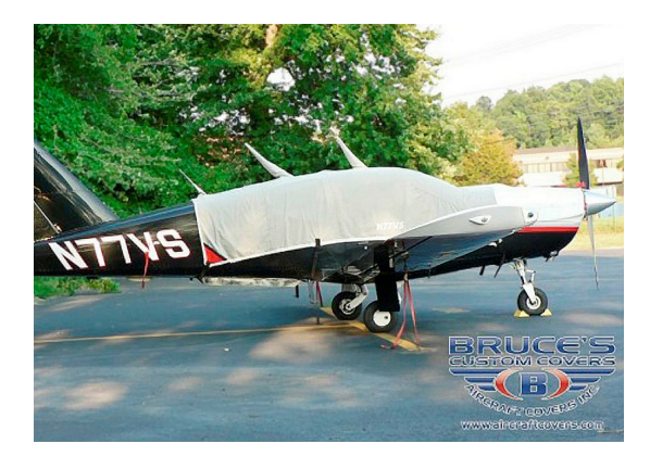
Socata TB20 Canopy Cover

This cover type is made from Silver Acrylic Sunbrella canvas and is 100% lined with a soft and smooth microfiber. Bruce's Custom Covers developed this material combination especially for aircraft protection. The outer material is medium weight and treated for water resistance, UV resistance and anti-static buildup. The inner lining is a very soft and smooth microfiber to prevent scratching. The material is very reflective, and tests show that the cabin interior temperature can be reduced to near-ambient temperature on the hottest of days. It is water, ice and snow repellent, yet breathable to allow moisture to escape from between the cover and the aircraft surface.