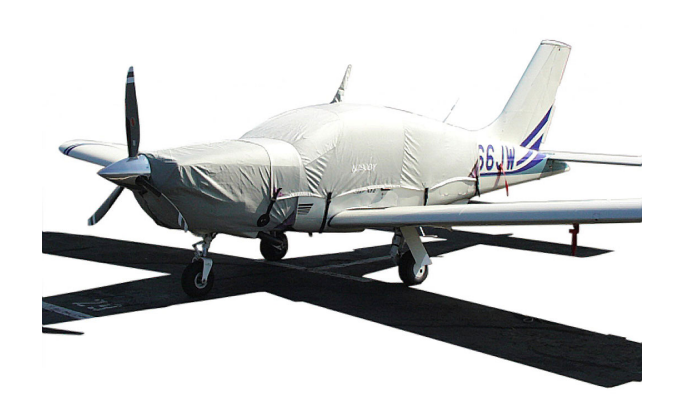
Canopy Cover & Engine Cover