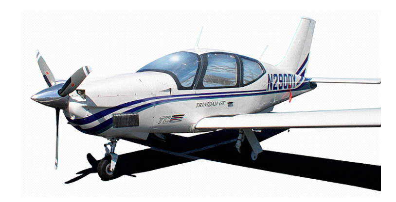
Socata TB20 HeatShields

Windshield Heatshields are interior sunshades for an aircraft's front windshield. The product is a unique composite of closed-cell foam with a silver mylar finish. The semi-rigid design is stiff enough to stand along the inside of the windshield using sun visors or window framing. It folds up flat and easily stores in the included storage sleeve. Some designs may require velcro and suction cups or split right and left sides. A Heatshield is an excellent short-term remedy for cockpit overheating. An external fabric cover is far more effective and practical for long-term protection.