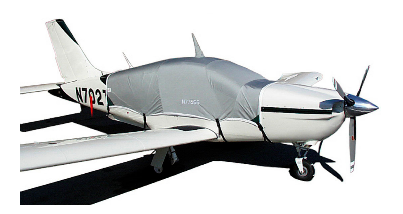
TB20 Standard Canopy Cover