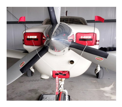
Socata TB-20 Engine Plugs, set of 3