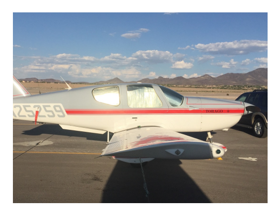
Socata TB-10 Cabin HeatShields