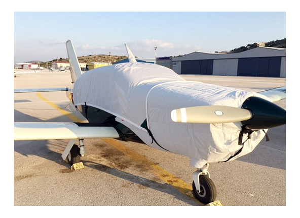
Socata TB-20 Canopy Cover, Insulated Engine Cover

This cover type is made from Silver Acrylic Sunbrella canvas and is 100% lined with a soft and smooth microfiber. Bruce's Custom Covers developed this material combination especially for aircraft protection. The outer material is medium weight and treated for water resistance, UV resistance and anti-static buildup. The inner lining is a very soft and smooth microfiber to prevent scratching. The material is very reflective, and tests show that the cabin interior temperature can be reduced to near-ambient temperature on the hottest of days. It is water, ice and snow repellent, yet breathable to allow moisture to escape from between the cover and the aircraft surface.