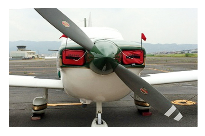
Socata TB-20 Engine Plugs