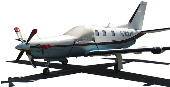
TBM 700 Cockpit Cover, Engine Plugs, Prop Tie/Exhaust Covers