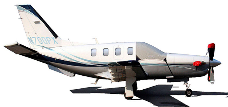
TBM 700 Cockpit Cover & Prop Tie-down/Exhaust Cover Set