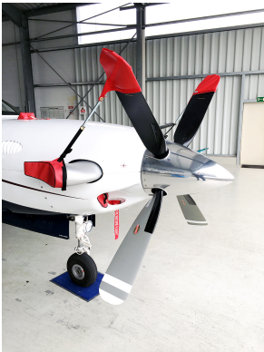
Piper PA-46-500TP PropTie/Exhaust Cover Set

This cover type is made from Silver Acrylic Sunbrella canvas and is 100% lined with a soft and smooth microfiber. Bruce's Custom Covers developed this material combination especially for aircraft protection. The outer material is medium weight and treated for water resistance, UV resistance and anti-static buildup. The inner lining is a very soft and smooth microfiber to prevent scratching. The material is very reflective, and tests show that the cabin interior temperature can be reduced to near-ambient temperature on the hottest of days. It is water, ice and snow repellent, yet breathable to allow moisture to escape from between the cover and the aircraft surface.