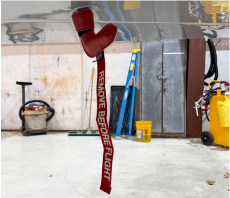
Compagnie Daher TBM 700 Pitot Covers (set of 2)

Engine Inlet Plugs are custom fit for your Socata TBM 700, 750, 850, 900, 910, 930, 940, 960 intakes, made with heavy-duty vinyl material, and stuffed with a single block of sculpted urethane foam. Each plug has a zipper that allows the foam to be removed and dried if necessary. Engine plugs have warning flags that are visible from the cockpit or 'remove before flight' streamers sewn onto the face of the plugs. Most plugs are imprinted with the aircraft registration number in black for an extra charge. Storage bag NOT included. Engine plugs may be inserted after flight when the engine is still warm. Engine Inlet Plugs are commonly referred to as Cowl Plugs, Intake Plugs, Cowl Blocks, Engine Blocks, and Engine Bung s. Designed to prevent damage to the aircraft extremities in crowded hangars, these products are made of bright red Naugahyde and thickly padded with a sandwich of closed cell foam.