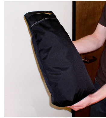
Light Weight Travel-Cover Mini-Storage Bag: 18" x 6" x 4"