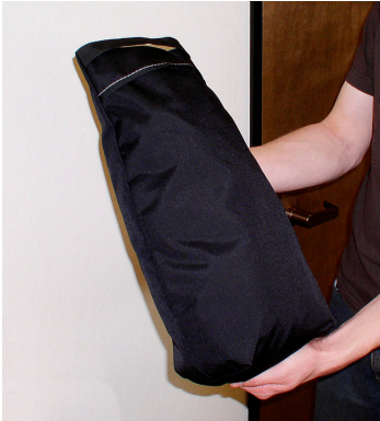
Light Weight Travel-Cover Mini-Storage Bag: 18" x 6" x 4"