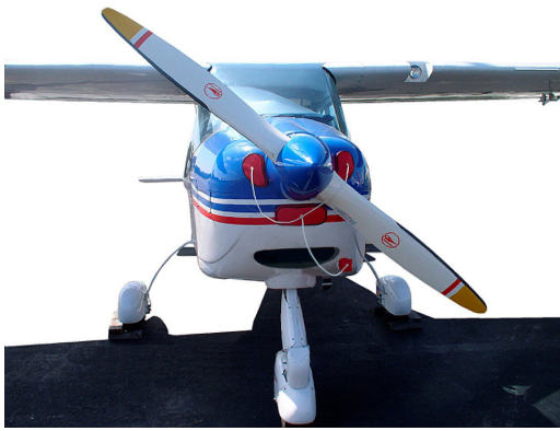
Tecnam Bravo Engine Plugs