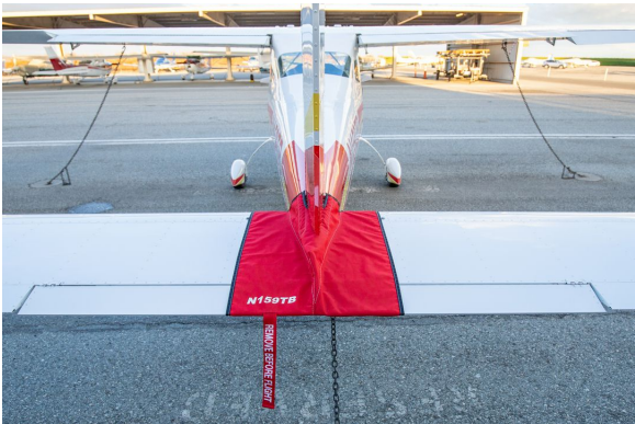
Tecnam Bravo Tailcone Cover