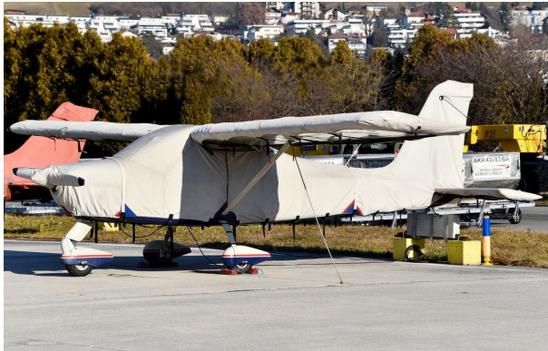
Tecnam P92 Echo Complete Cover Set