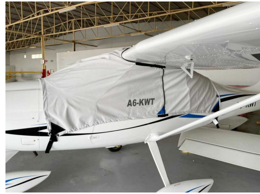
Tecnam P92 Echo Super Canopy Cover, Wrap-Around