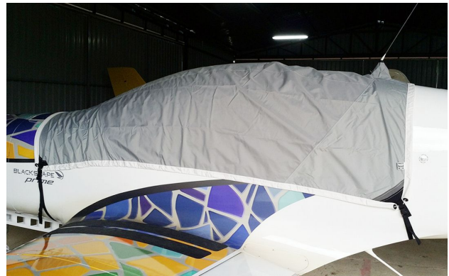
Blackshape Prime Travel Cover, Light Weight Travel Canopy Cover