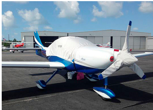
Lancair Canopy Cover, Plugs & Prop Cover