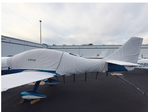
Lancair ES Wing Covers & Empennage Cover (sold separately)

WINTER USE MATERIAL - Made with Solution-Dyed Polyester fabric, this option is intended for seasonal use to aid in deicing, rain mitigation, or for occasional travel. The material is lighter and more compact, but more susceptible to UV damage and may have a shorter useful life if used continuously outside than the all-year use material.