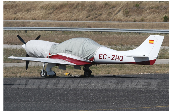
Lancair 360 Canopy Cover, Engine Cover