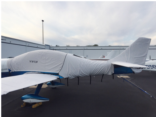
Lancair ES Wing Covers & Empennage Cover (sold separately)

This cover type is made from Silver Acrylic Sunbrella canvas and is 100% lined with a soft and smooth microfiber. Bruce's Custom Covers developed this material combination especially for aircraft protection. The outer material is medium weight and treated for water resistance, UV resistance and anti-static buildup. The inner lining is a very soft and smooth microfiber to prevent scratching. The material is very reflective, and tests show that the cabin interior temperature can be reduced to near-ambient temperature on the hottest of days. It is water, ice and snow repellent, yet breathable to allow moisture to escape from between the cover and the aircraft surface.