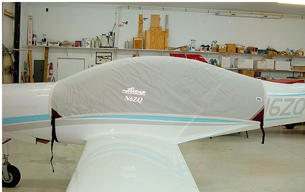
Lancair 320 Standard Canopy Cover

This cover type is made from Silver Acrylic Sunbrella canvas and is 100% lined with a soft and smooth microfiber. Bruce's Custom Covers developed this material combination especially for aircraft protection. The outer material is medium weight and treated for water resistance, UV resistance and anti-static buildup. The inner lining is a very soft and smooth microfiber to prevent scratching. The material is very reflective, and tests show that the cabin interior temperature can be reduced to near-ambient temperature on the hottest of days. It is water, ice and snow repellent, yet breathable to allow moisture to escape from between the cover and the aircraft surface.