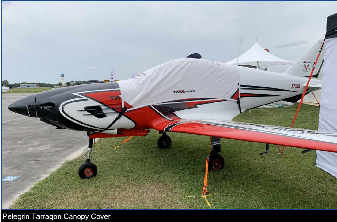
Pelegrin Tarragon Canopy Cover