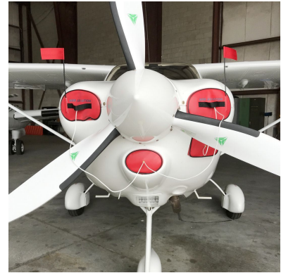
Tecnam P2010 Engine Plugs