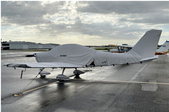
Tecnam P2002 Sierra Complete Cover Set

This cover type is made from Silver Acrylic Sunbrella canvas and is 100% lined with a soft and smooth microfiber. Bruce's Custom Covers developed this material combination especially for aircraft protection. The outer material is medium weight and treated for water resistance, UV resistance and anti-static buildup. The inner lining is a very soft and smooth microfiber to prevent scratching. The material is very reflective, and tests show that the cabin interior temperature can be reduced to near-ambient temperature on the hottest of days. It is water, ice and snow repellent, yet breathable to allow moisture to escape from between the cover and the aircraft surface.