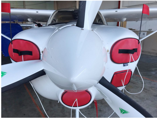
Tecnam Engine Plugs, set of 5