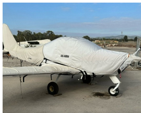
Tecnam Sierra Complete Cover Set