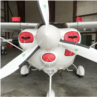
Tecnam P2010 Engine Plugs

Engine Inlet Plugs are custom fit for your Tecnam P2002 Sierra, P96 Golf, P-Mentor intakes, made with heavy-duty vinyl material, and stuffed with a single block of sculpted urethane foam. Each plug has a zipper that allows the foam to be removed and dried if necessary. Engine plugs have warning flags that are visible from the cockpit or 'remove before flight' streamers sewn onto the face of the plugs. Most plugs are imprinted with the aircraft registration number in black for an extra charge. Storage bag NOT included. Engine plugs may be inserted after flight when the engine is still warm. Engine Inlet Plugs are commonly referred to as Cowl Plugs, Intake Plugs, Cowl Blocks, Engine Blocks, and Engine Bungs.