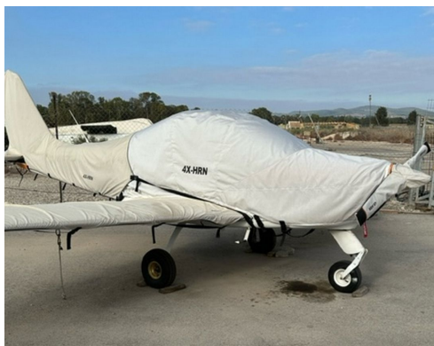
Tecnam Sierra Complete Cover Set

This cover type is made from Silver Acrylic Sunbrella canvas and is 100% lined with a soft and smooth microfiber. Bruce's Custom Covers developed this material combination especially for aircraft protection. The outer material is medium weight and treated for water resistance, UV resistance and anti-static buildup. The inner lining is a very soft and smooth microfiber to prevent scratching. The material is very reflective, and tests show that the cabin interior temperature can be reduced to near-ambient temperature on the hottest of days. It is water, ice and snow repellent, yet breathable to allow moisture to escape from between the cover and the aircraft surface.