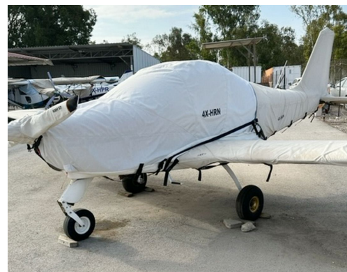
Tecnam Sierra Complete Cover Set