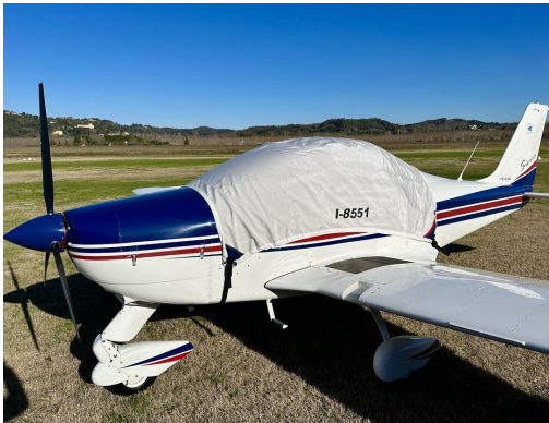
Tecnam P2002 Sierra Canopy Cover