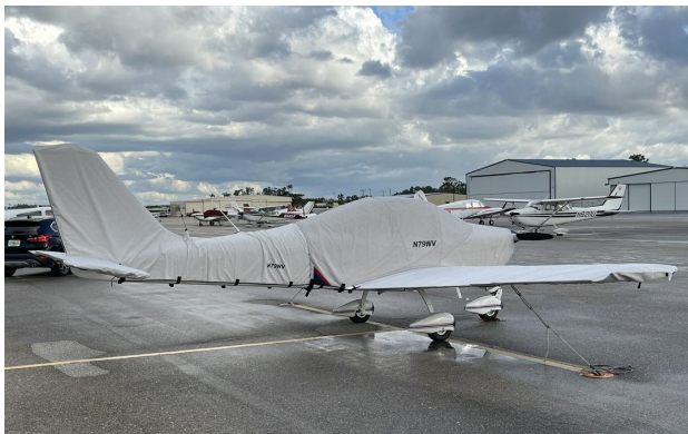
Tecnam P2002 Sierra Complete Cover Set

This cover type is made from Silver Acrylic Sunbrella canvas and is 100% lined with a soft and smooth microfiber. Bruce's Custom Covers developed this material combination especially for aircraft protection. The outer material is medium weight and treated for water resistance, UV resistance and anti-static buildup. The inner lining is a very soft and smooth microfiber to prevent scratching. The material is very reflective, and tests show that the cabin interior temperature can be reduced to near-ambient temperature on the hottest of days. It is water, ice and snow repellent, yet breathable to allow moisture to escape from between the cover and the aircraft surface.