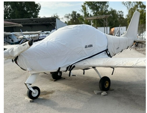
Tecnam Sierra Complete Cover Set