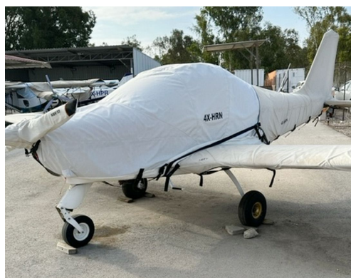
Tecnam Sierra Complete Cover Set

This cover type is made from Silver Acrylic Sunbrella canvas and is 100% lined with a soft and smooth microfiber. Bruce's Custom Covers developed this material combination especially for aircraft protection. The outer material is medium weight and treated for water resistance, UV resistance and anti-static buildup. The inner lining is a very soft and smooth microfiber to prevent scratching. The material is very reflective, and tests show that the cabin interior temperature can be reduced to near-ambient temperature on the hottest of days. It is water, ice and snow repellent, yet breathable to allow moisture to escape from between the cover and the aircraft surface.