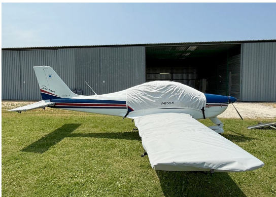
Tecnam P2002 Sierra Canopy, Wing & Horizontal Stabilizer Covers