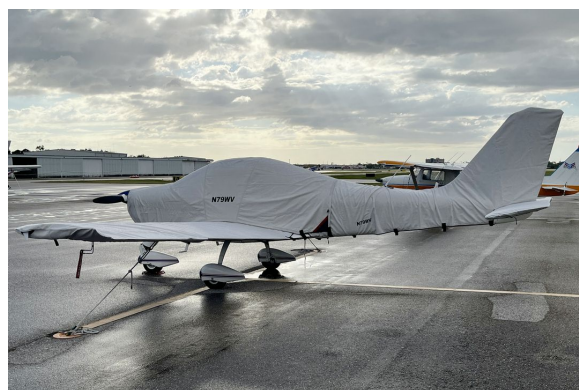
Tecnam P2002 Sierra Complete Cover Set