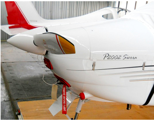
Tecnam Sierra Engine Inlet Plugs set

Engine Inlet Plugs are custom fit for your Tecnam P2002 Sierra, P96 Golf, P-Mentor intakes, made with heavy-duty vinyl material, and stuffed with a single block of sculpted urethane foam. Each plug has a zipper that allows the foam to be removed and dried if necessary. Engine plugs have warning flags that are visible from the cockpit or 'remove before flight' streamers sewn onto the face of the plugs. Most plugs are imprinted with the aircraft registration number in black for an extra charge. Storage bag NOT included. Engine plugs may be inserted after flight when the engine is still warm. Engine Inlet Plugs are commonly referred to as Cowl Plugs, Intake Plugs, Cowl Blocks, Engine Blocks, and Engine Bungs.