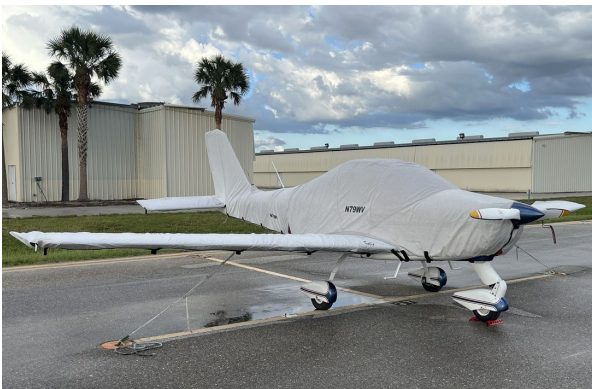
Tecnam P2002 Sierra Complete Cover Set

WINTER USE MATERIAL - Made with Solution-Dyed Polyester fabric, this option is intended for seasonal use to aid in deicing, rain mitigation, or for occasional travel. The material is lighter and more compact, but more susceptible to UV damage and may have a shorter useful life if used continuously outside than the all-year use material.