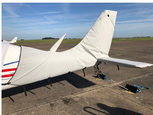
Tecnam P2008 Empennage Cover (Tailboom, Vertical & Horiz Stabilizers), All Year Use

WINTER USE MATERIAL - Made with Solution-Dyed Polyester fabric, this option is intended for seasonal use to aid in deicing, rain mitigation, or for occasional travel. The material is lighter and more compact, but more susceptible to UV damage and may have a shorter useful life if used continuously outside than the all-year use material.