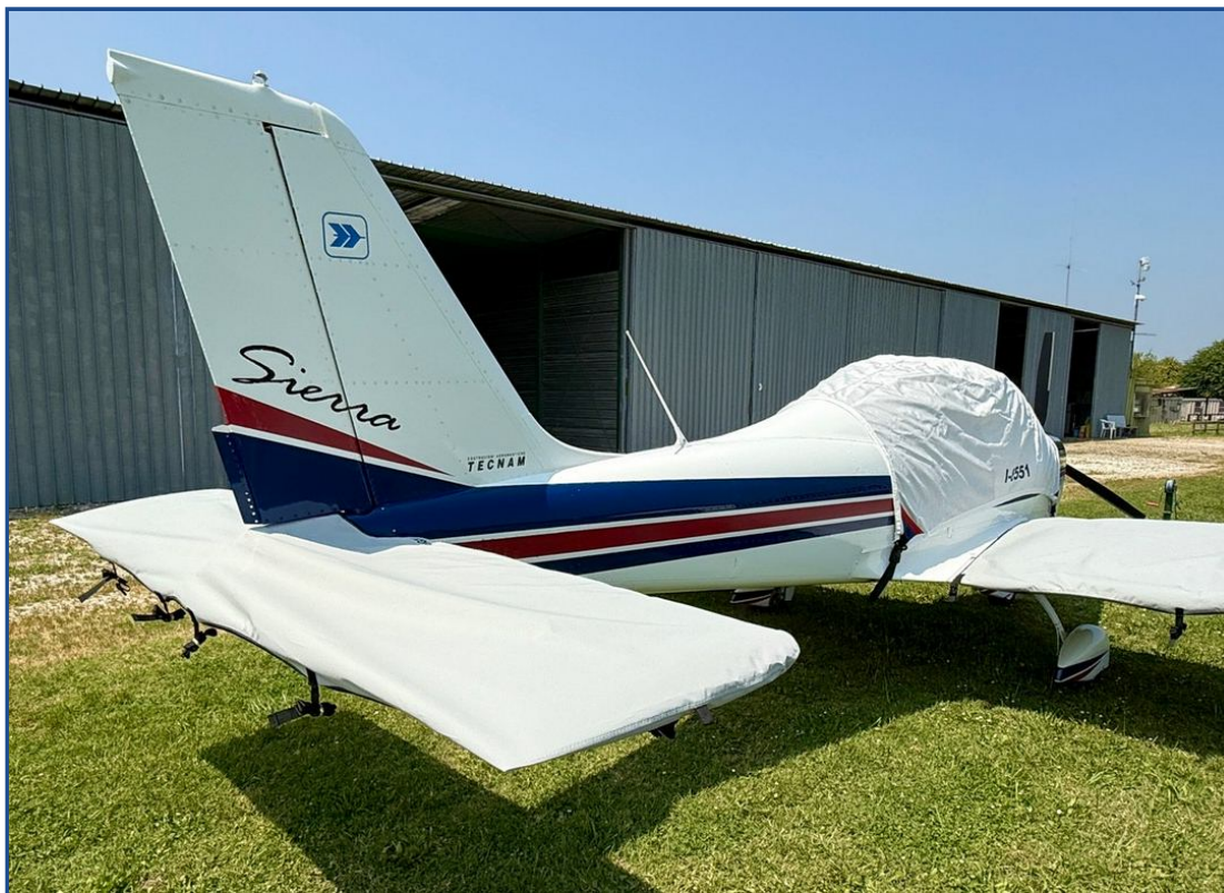
Tecnam P2002 Sierra Canopy, Wing &amp; Horizontal Stabilizer Covers