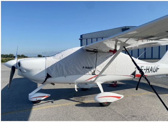
Tecnam P2010 Over-Top Canopy Cover