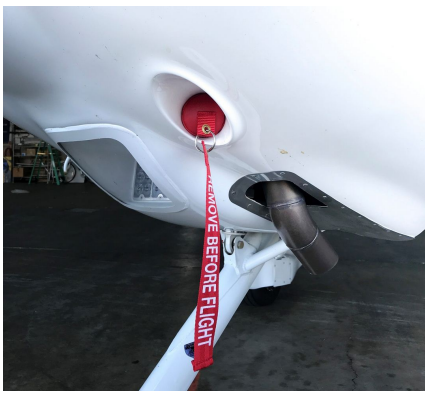
Tecnam P2010 Small Engine Inlet Plug