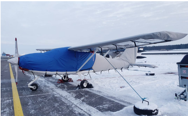
Tecnam P2010 Wing, Empennage & Prop Covers

WINTER USE MATERIAL - Made with Solution-Dyed Polyester fabric, this option is intended for seasonal use to aid in deicing, rain mitigation, or for occasional travel. The material is lighter and more compact, but more susceptible to UV damage and may have a shorter useful life if used continuously outside than the all-year use material.