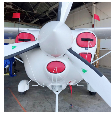
Tecnam Engine Plugs, set of 5