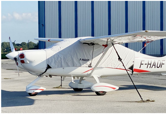
Tecnam P2010 Over-Top Canopy Cover, Engine Plugs