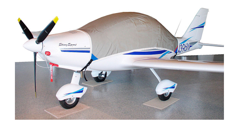
Sting Sport Canopy Cover & Engine Plugs