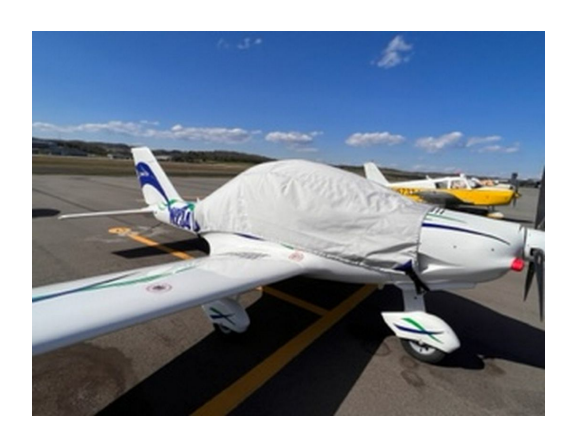
TL 2000 Sting Travel Weight Canopy Cover

This cover type is made from Silver Acrylic Sunbrella canvas and is 100% lined with a soft and smooth microfiber. Bruce's Custom Covers developed this material combination especially for aircraft protection. The outer material is medium weight and treated for water resistance, UV resistance and anti-static buildup. The inner lining is a very soft and smooth microfiber to prevent scratching. The material is very reflective, and tests show that the cabin interior temperature can be reduced to near-ambient temperature on the hottest of days. It is water, ice and snow repellent, yet breathable to allow moisture to escape from between the cover and the aircraft surface.