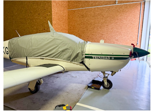
Trinidad TB20 Travel Cover, Light Weight Canopy Cover