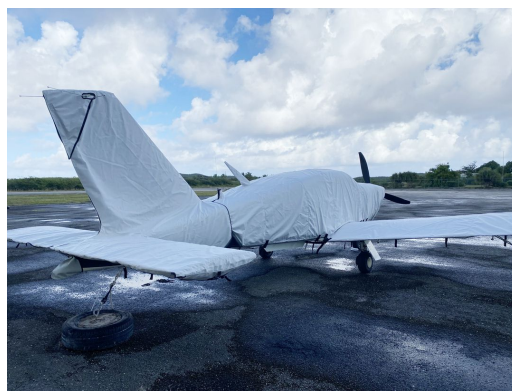
Socata Trinidad Full Cover Set