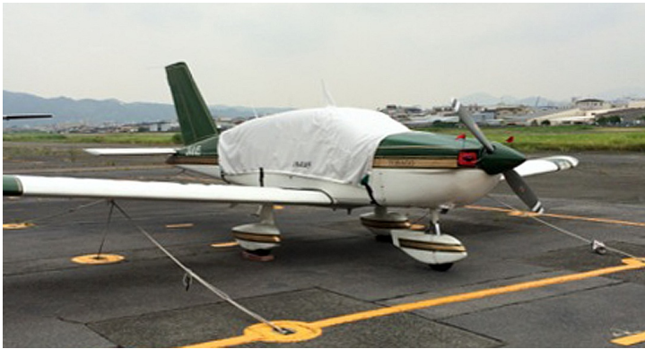
Socata TB-20 Canopy Cover

This cover type is made from Silver Acrylic Sunbrella canvas and is 100% lined with a soft and smooth microfiber. Bruce's Custom Covers developed this material combination especially for aircraft protection. The outer material is medium weight and treated for water resistance, UV resistance and anti-static buildup. The inner lining is a very soft and smooth microfiber to prevent scratching. The material is very reflective, and tests show that the cabin interior temperature can be reduced to near-ambient temperature on the hottest of days. It is water, ice and snow repellent, yet breathable to allow moisture to escape from between the cover and the aircraft surface.