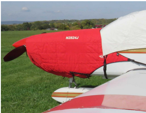
Socata TB-10 Insulated Engine Cover

This cover type is made from Silver Acrylic Sunbrella canvas and is 100% lined with a soft and smooth microfiber. Bruce's Custom Covers developed this material combination especially for aircraft protection. The outer material is medium weight and treated for water resistance, UV resistance and anti-static buildup. The inner lining is a very soft and smooth microfiber to prevent scratching. The material is very reflective, and tests show that the cabin interior temperature can be reduced to near-ambient temperature on the hottest of days. It is water, ice and snow repellent, yet breathable to allow moisture to escape from between the cover and the aircraft surface.