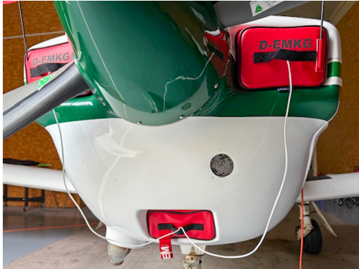
Trinidad TB20 Engine Inlet Plugs (set of 3)

Engine Inlet Plugs are custom fit for your Socata Tampico, Tobago & Trinidad intakes, made with heavy-duty vinyl material, and stuffed with a single block of sculpted urethane foam. Each plug has a zipper that allows the foam to be removed and dried if necessary. Engine plugs have warning flags that are visible from the cockpit or 'remove before flight' streamers sewn onto the face of the plugs. Most plugs are imprinted with the aircraft registration number in black for an extra charge. Storage bag NOT included. Engine plugs may be inserted after flight when the engine is still warm. Engine Inlet Plugs are commonly referred to as Cowl Plugs, Intake Plugs, Cowl Blocks, Engine Blocks, and Engine Bungs.