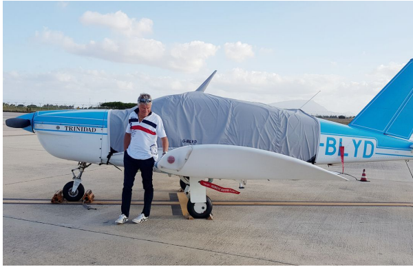
Socata Tampico, Tobago & Trinidad Travel Cover, Light Weight Canopy Cover

Travel Covers are made with Silver Solution-Dyed Polyester fabric and only lined over the windshield to save weight. The material is lightweight and more compact for easy stowage in the aircraft. The polyester material is water resistant, but only intended for occasional use outside. We also have an ultra lightweight material available for fitted hangar dust covers. For daily outdoor use, the non-travel Sunbrella Cover is the best choice.