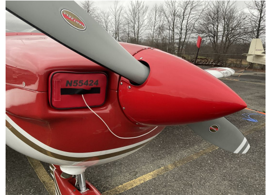
Socata Tobago Engine Plugs