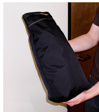
Light Weight Travel-Cover Mini-Storage Bag: 18" x 6" x 4"