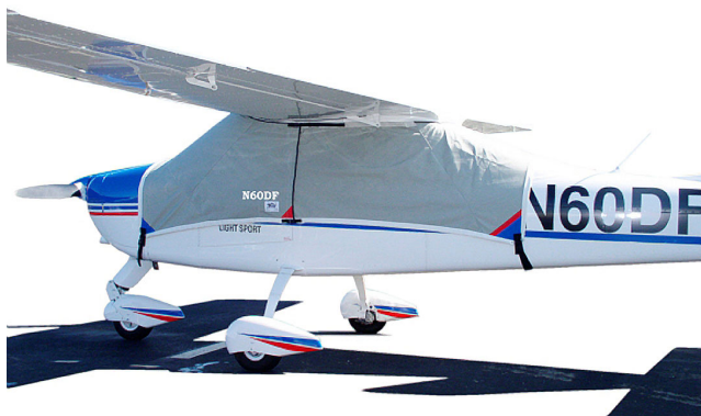
Tecnam Bravo Canopy Cover