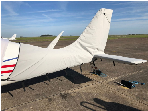
Tecnam P2008 Empennage Cover (Tailboom, Vertical & Horiz Stabilizers), All Year Use

WINTER USE MATERIAL - Made with Solution-Dyed Polyester fabric, this option is intended for seasonal use to aid in deicing, rain mitigation, or for occasional travel. The material is lighter and more compact, but more susceptible to UV damage and may have a shorter useful life if used continuously outside than the all-year use material.