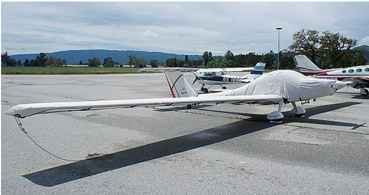
Grob 109 Canopy/Engine w/ extension to tail, Wing, Stabilizer & Prop/Spinner Covers

WINTER USE MATERIAL - Made with Solution-Dyed Polyester fabric, this option is intended for seasonal use to aid in deicing, rain mitigation, or for occasional travel. The material is lighter and more compact, but more susceptible to UV damage and may have a shorter useful life if used continuously outside than the all-year use material.