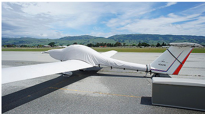
Grob 109 Canopy/Engine w/ extension to tail, Wing, Stabilizer & Prop/Spinner Covers