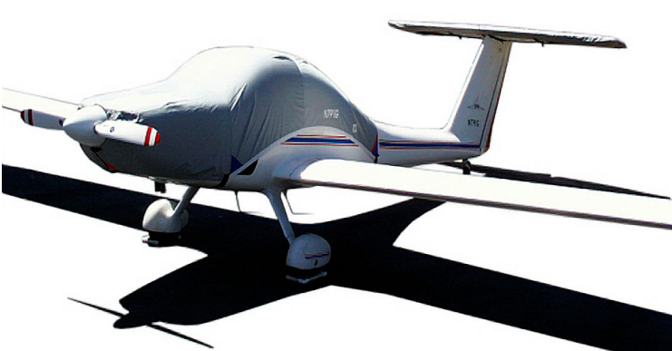
Grob 109 Canopy/Engine Cover & Horiz. Stabilizer Cover