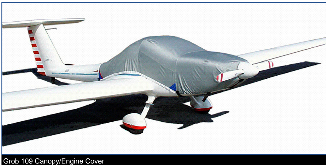
Grob 109 Canopy/Engine Cover