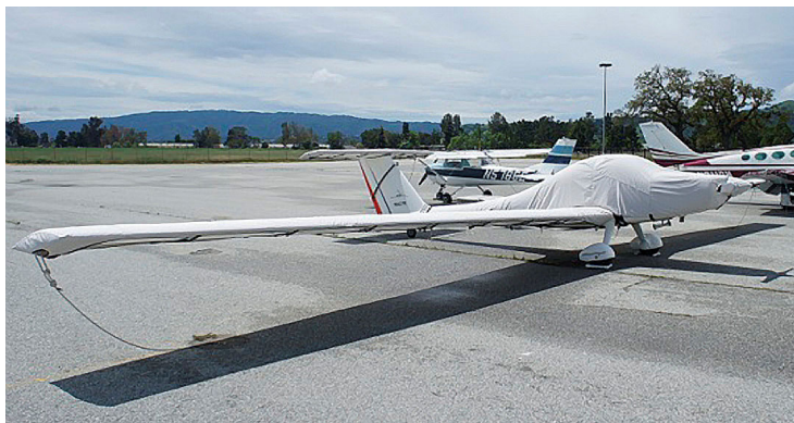
Grob 109 Canopy/Engine w/ extension to tail, Wing, Stabilizer & Prop/Spinner Covers