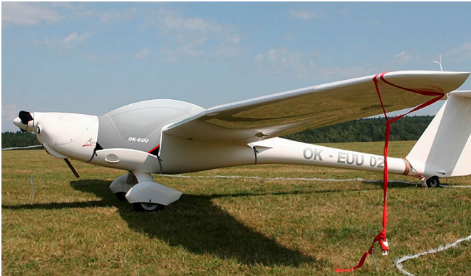
Lambda Canopy Cover (illustration)