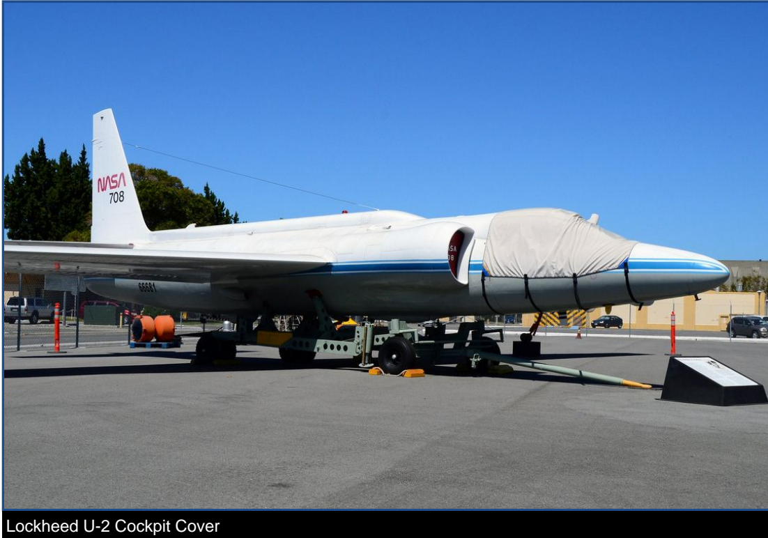
Lockheed U-2 Cockpit Cover