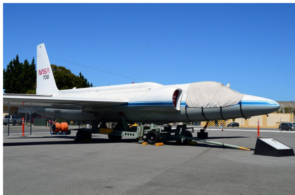
Lockheed U-2 Cockpit Cover

This cover type is made from Silver Acrylic Sunbrella canvas and is 100% lined with a soft and smooth microfiber. Bruce's Custom Covers developed this material combination especially for aircraft protection. The outer material is medium weight and treated for water resistance, UV resistance and anti-static buildup. The inner lining is a very soft and smooth microfiber to prevent scratching. The material is very reflective, and tests show that the cabin interior temperature can be reduced to near-ambient temperature on the hottest of days. It is water, ice and snow repellent, yet breathable to allow moisture to escape from between the cover and the aircraft surface.