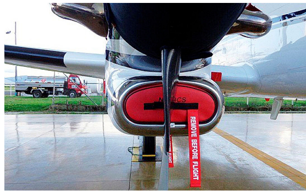
Beech King Air C90B Main Engine Inlet Plug