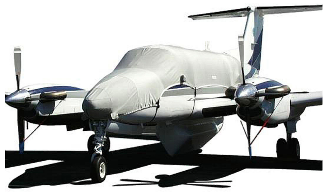
King Air Canopy/Nose Cover