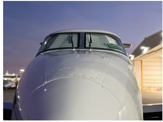
Beechcraft B200 Cockpit Heatshields