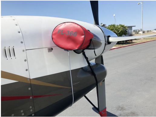
Beech King Air 350 Prop Tie-Downs/Exhaust Covers Combination

The material is very reflective, and tests show that the cabin interior temperature can be reduced to near-ambient temperature on the hottest of days. It is water, ice and snow repellent, yet breathable to allow moisture to escape from between the cover and the aircraft surface.