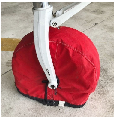
Beech King Air 300 Tire Covers (nose gear)

ALL-YEAR USE MATERIAL - Made with Silver Acrylic Sunbrella canvas, the all-year use material is the best option for sun protection and cover longevity. This heavier more durable material is intended for all weather conditions, such as rain and snow or lots of sun.