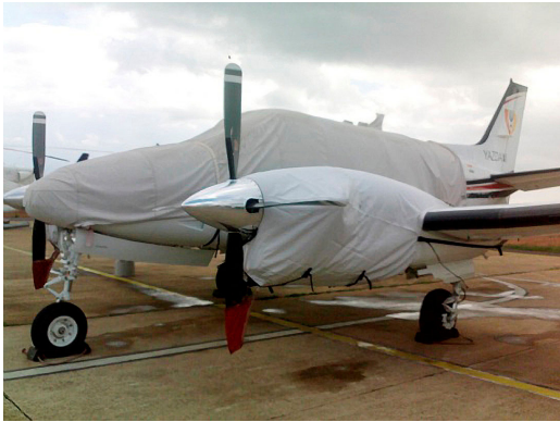
King Air C90 Canopy/Nose Cover, Engine Covers