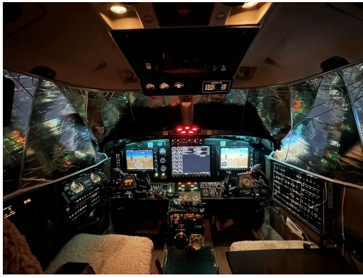
Beechcraft B200 Cockpit Heatshields