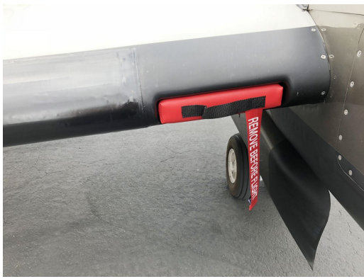
Beech King Air Heat Exchanger Inlet Plug