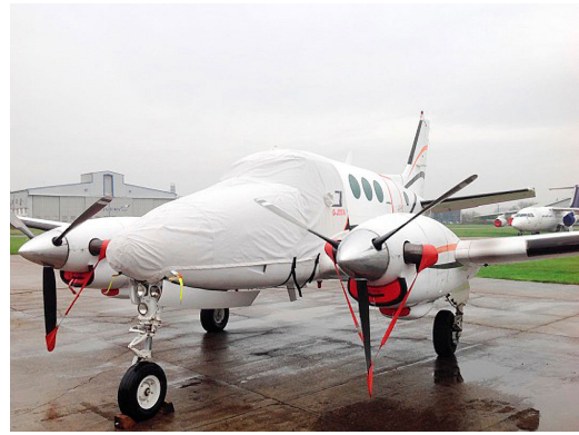
King Air Cockpit/Nose Cover, Plugs, Prop Tie/Exhaust Covers