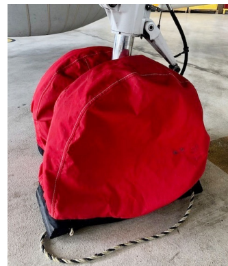
Beech King Air 300 Tire Covers (main gear)