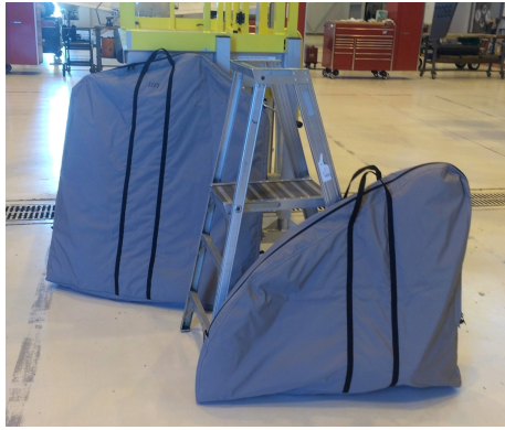
Eurocopter EC-145 Padded Bags for Removable Doors

**Padded Door Bags* are designed to provide portable protection of the doors when they are removed from the aircraft. They are padded to moderate thickness, zippered closed, and have sturdy carry handles for easy transport.