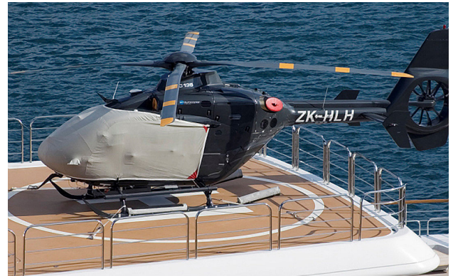
Eurocopter EC-145 Main Body Cover, also covers the bottom belly