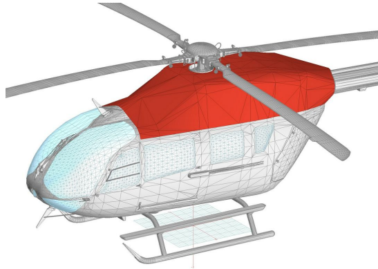
Intake/Exhaust Engine Area Cover, 3D Rendering

The Engine Inlet Plugs are custom fit for your Eurocopter UH-72 (EC-145) intakes, made with heavy-duty vinyl material, and stuffed with a single block of sculpted urethane foam. Each plug has a zipper that allows the foam to be removed and dried if necessary. Engine plugs have 'Remove Before Flight' streamers sewn onto the face of the plugs. Most plugs are imprinted with the aircraft registration number in black for an extra charge. Storage bag NOT included. Engine plugs may be inserted after flight when the engine is still warm. Engine Inlet Plugs are commonly referred to as Cowl Plugs, Intake Plugs, Cowl Blocks, Engine Blocks, and Engine Bungs.