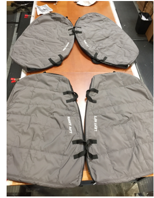
MD 500D Padded Door Bags