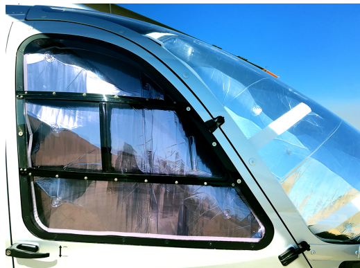
Eurocopter EC-145 Cockpit Heatshields

Cockpit Heatshields are interior sunshades for the aircraft's cockpit. The product is a unique composite of closed-cell foam with a silver mylar finish. The semi-rigid design is stiff enough to stand inside the window framing. Darts and folds are incorporated into the material so that it conforms to the complex shape of the helicopter windows. The set folds up flat and is easily stored in the included storage sleeve. Some designs may require velcro and suction cups. A Heatshield is an excellent short-term remedy for cockpit overheating, but an external fabric cover is more effective for long-term protection.