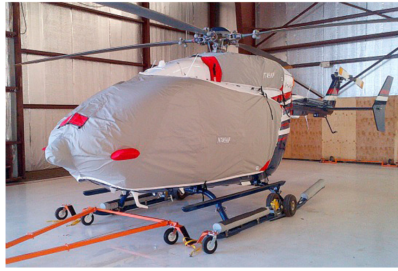
Bubble Cover w/ nose mounted radome & Upper Deck Plugs/Cover