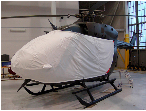
EC-145 Bubble Cover