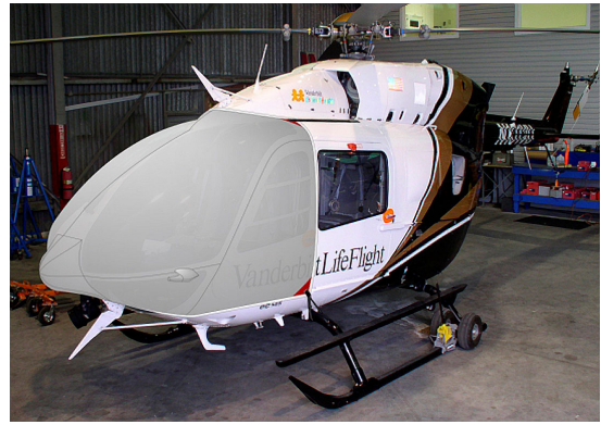
EC-145 Windshield/Nose Cover (illustration)