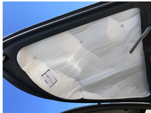
Eurocopter EC-145 Cockpit Heatshields