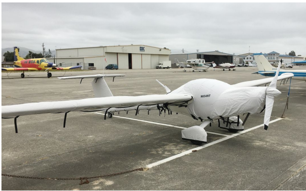
Distar Sundancer LSA Extended Canopy/Engine, Prop, Wheelpants, Wings & Empennage Covers

WINTER USE MATERIAL - Made with Solution-Dyed Polyester fabric, this option is intended for seasonal use to aid in deicing, rain mitigation, or for occasional travel. The material is lighter and more compact, but more susceptible to UV damage and may have a shorter useful life if used continuously outside than the all-year use material.