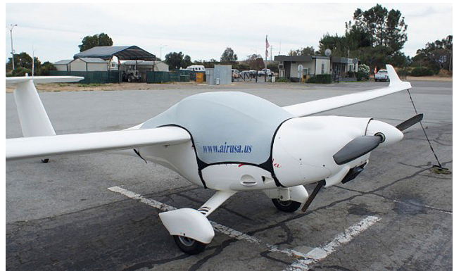
Lambda Travel Canopy Cover