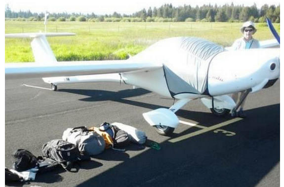
Distar Sundancer Travel Weight Canopy Cover