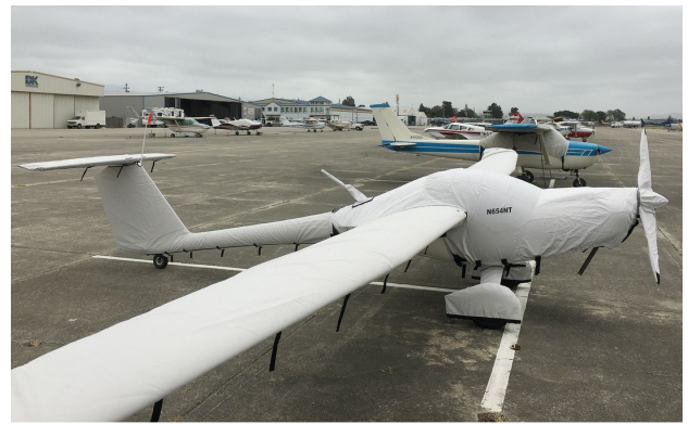
Distar Sundancer LSA Extended Canopy/Engine, Prop, Wheelpants, Wings & Empennage Covers