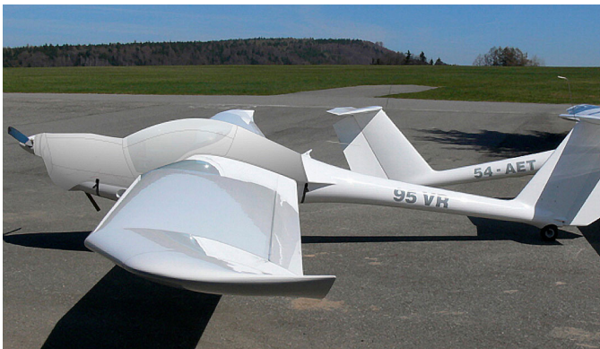
Lambda Canopy/Engine Cover (illustration)