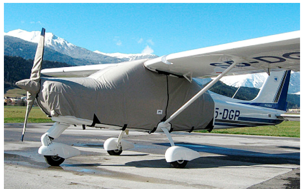
Tecnam Echo Extended Canopy, Engine, Prop Covers