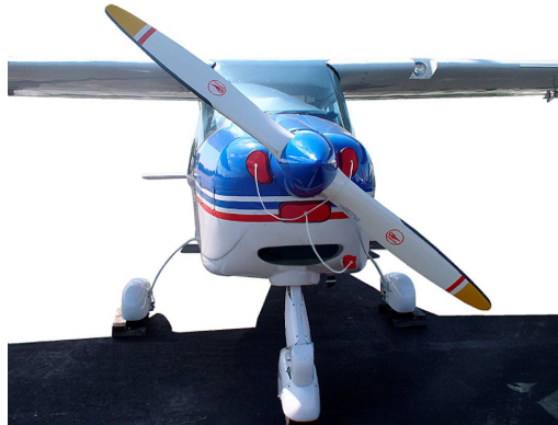
Tecnam Bravo Engine Plugs

Engine Inlet Plugs are custom fit for your Vulcanair V1.0 intakes, made with heavy-duty vinyl material, and stuffed with a single block of sculpted urethane foam. Each plug has a zipper that allows the foam to be removed and dried if necessary. Engine plugs have warning flags that are visible from the cockpit or 'remove before flight' streamers sewn onto the face of the plugs. Most plugs are imprinted with the aircraft registration number in black for an extra charge. Storage bag NOT included. Engine plugs may be inserted after flight when the engine is still warm. Engine Inlet Plugs are commonly referred to as Cowl Plugs, Intake Plugs, Cowl Blocks, Engine Blocks, and Engine Bungs.