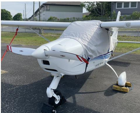
Tecnam P92 EAGLET Canopy Cover Over theTop Style