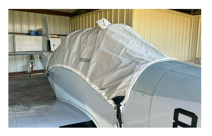
Varga Kachina Travel Cover, Light Weight Canopy Cover