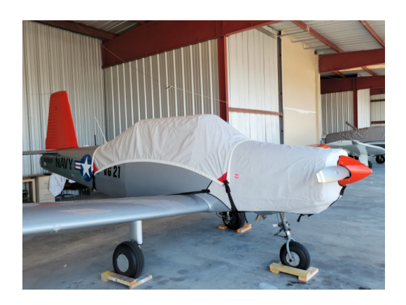
Varga Kachina Canopy & Engine Covers