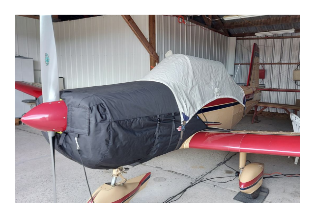
Varga 2150A Insulated Engine Cover, Canopy Cover

This cover type is made from Silver Acrylic Sunbrella canvas and is 100% lined with a soft and smooth microfiber. Bruce's Custom Covers developed this material combination especially for aircraft protection. The outer material is medium weight and treated for water resistance, UV resistance and anti-static buildup. The inner lining is a very soft and smooth microfiber to prevent scratching. The material is very reflective, and tests show that the cabin interior temperature can be reduced to near-ambient temperature on the hottest of days. It is water, ice and snow repellent, yet breathable to allow moisture to escape from between the cover and the aircraft surface.