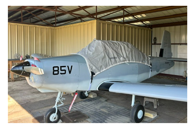
Varga Kachina Travel Cover, Light Weight Canopy Cover