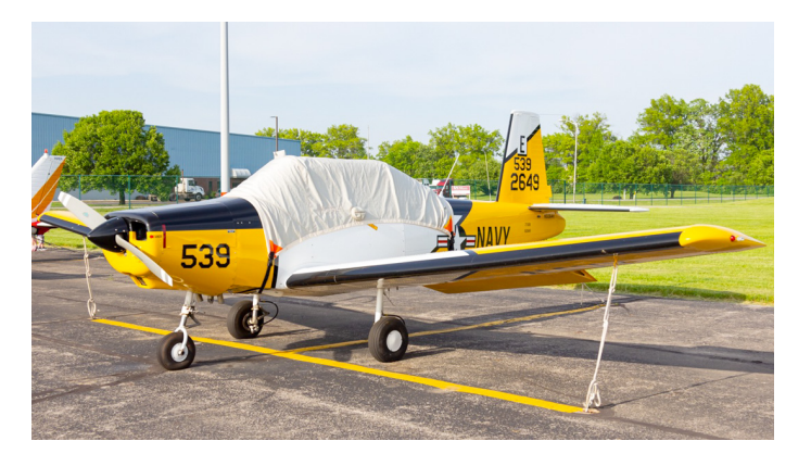
Varga Kachina Canopy Cover