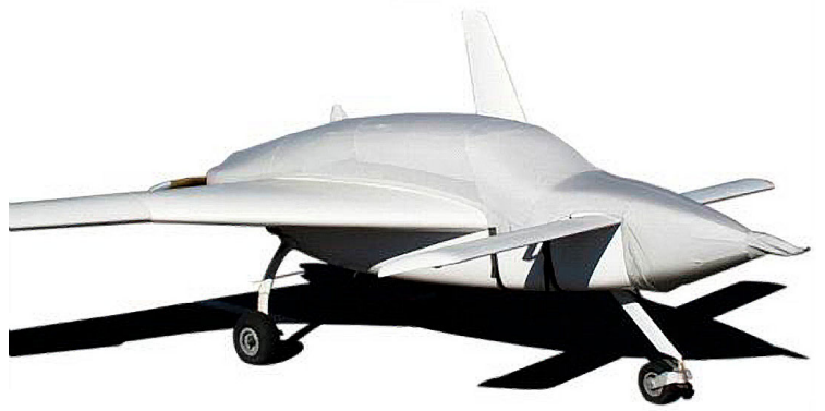
Velocity Canopy/Nose/Engine Cover