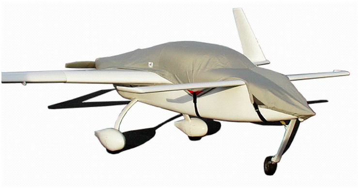
Cozy III Canopy/Nose/Engine Cover