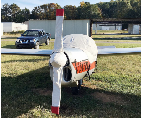
Aerotechnik L-13 Vivat Motorglider Prop/Spinner &amp; Canopy Covers