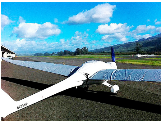
Lambada Canopy/Engine Cover and Wing Covers