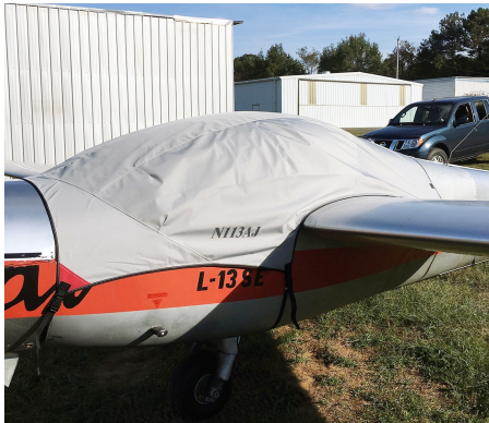
Aerotechnik L-13 Travel Cover