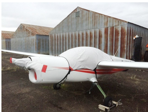
Vivat Canopy and Prop/Spinner Cover