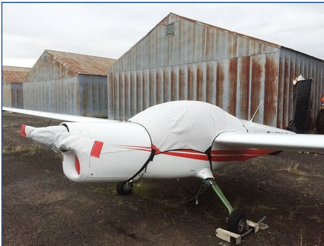
Vivat Canopy and Prop/Spinner Cover