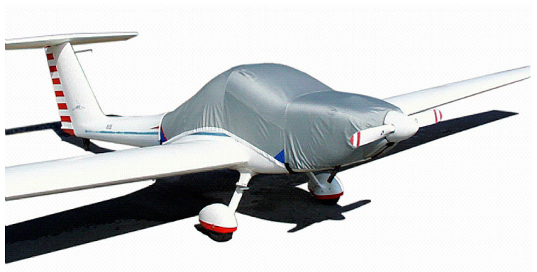
Grob 109 Canopy/Engine Cover