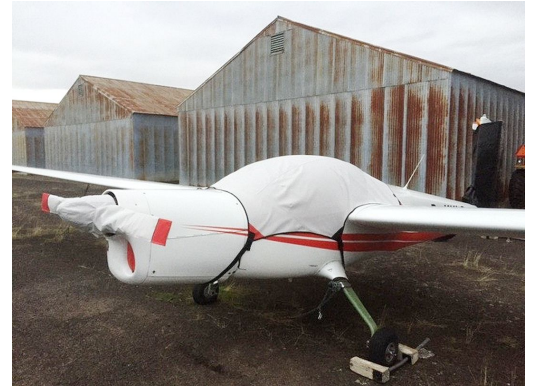
Vivat Canopy and Prop/Spinner Cover