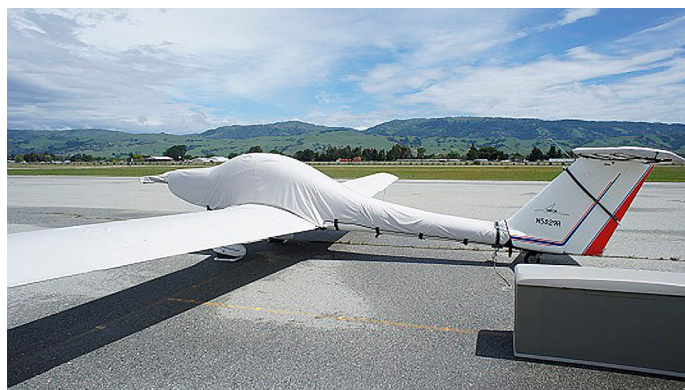
Grob 109 Canopy/Engine w/ extension to tail, Wing, Stabilizer & Prop/Spinner Covers