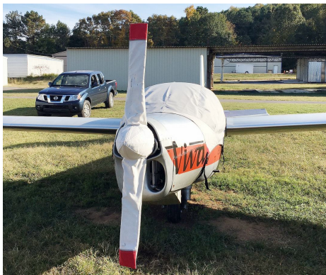
Aerotechnik L-13 Vivat Motorglider Prop/Spinner &amp; Canopy Covers