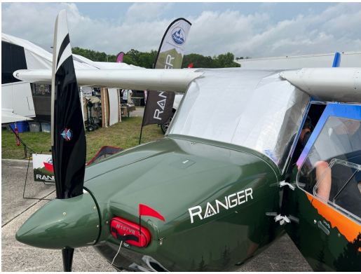
Vashon Ranger VR-7 Engine Plugs, Windshield HeatShield