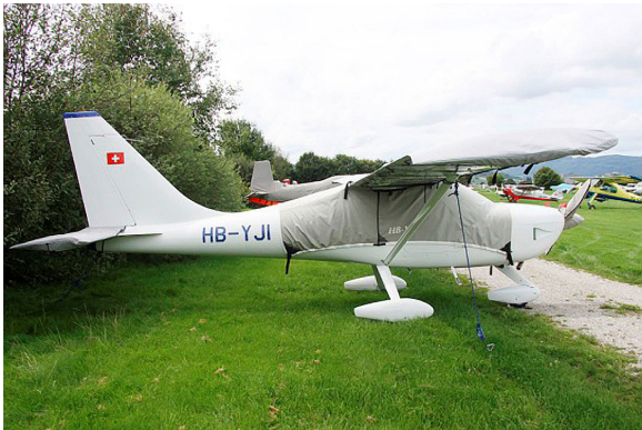
Glstar Canopy, Wings, Horizontal Stab. & Prop Covers

WINTER USE MATERIAL - Made with Solution-Dyed Polyester fabric, this option is intended for seasonal use to aid in deicing, rain mitigation, or for occasional travel. The material is lighter and more compact, but more susceptible to UV damage and may have a shorter useful life if used continuously outside than the all-year use material.