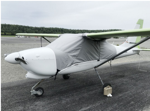
Glasair Aviation Glastar, Sportsman 2+2 Travel Cover, Light Weight Travel Canopy Cover

Travel Covers are made with Silver Solution-Dyed Polyester fabric and only lined over the windshield to save weight. The material is lightweight and more compact for easy stowage in the aircraft. The polyester material is water resistant, but only intended for occasional use outside. We also have an ultra lightweight material available for fitted hangar dust covers. For daily outdoor use, the non-travel Sunbrella Cover is the best choice.