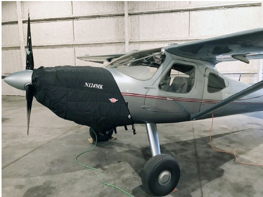
Glasair Aviation Glastar, Sportsman 2+2 Insulated Engine Cover