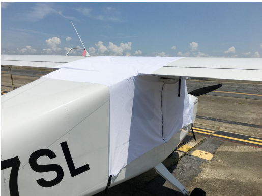
Vashon Ranger VR-7 Canopy Cover, test fit cover