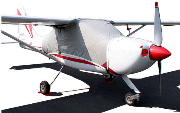
Glaster Over-Top Canopy Cover