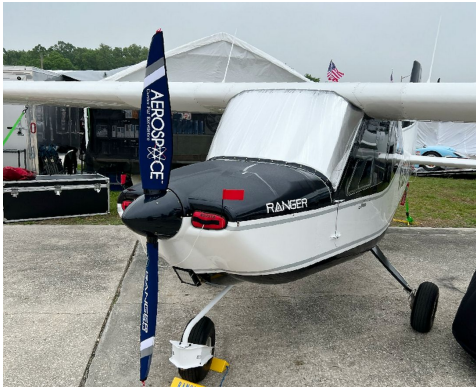
Vashon Ranger Engine Inlet Plugs