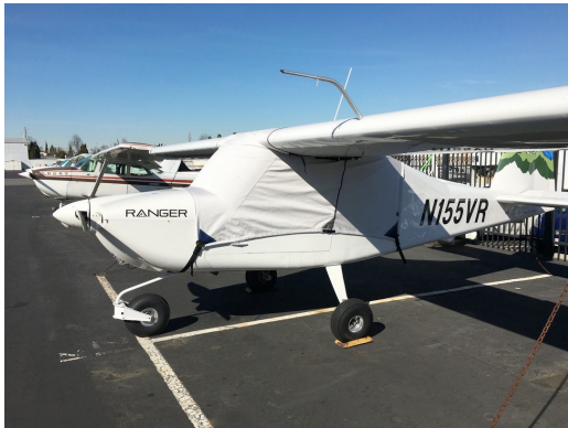
Vashon Ranger R7 Canopy Cover, Over-Top Type