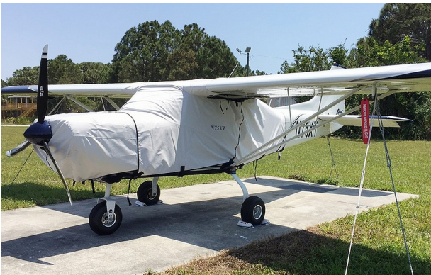
World Aircraft Extended Canopy Cover & Engine Cover

This cover type is made from Silver Acrylic Sunbrella canvas and is 100% lined with a soft and smooth microfiber. Bruce's Custom Covers developed this material combination especially for aircraft protection. The outer material is medium weight and treated for water resistance, UV resistance and anti-static buildup. The inner lining is a very soft and smooth microfiber to prevent scratching. The material is very reflective, and tests show that the cabin interior temperature can be reduced to near-ambient temperature on the hottest of days. It is water, ice and snow repellent, yet breathable to allow moisture to escape from between the cover and the aircraft surface.