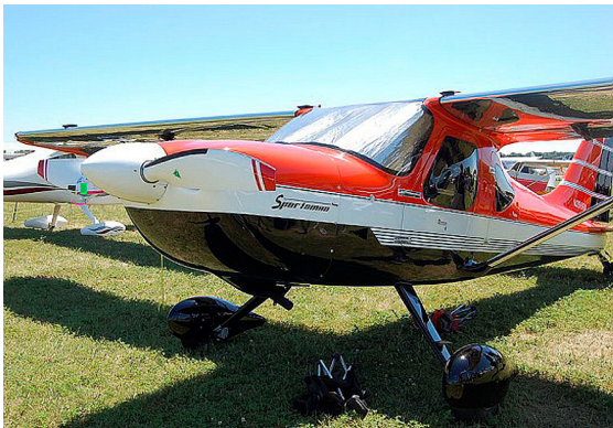
Glastar Sportsman Windshield HeatShield