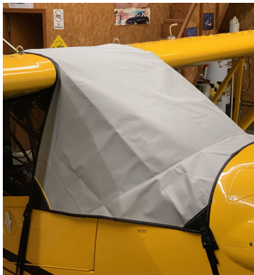
Cub Crafter's Carbon Cub FX3 Windshield/Skylight Cover, travel weight

This cover type is made from Silver Acrylic Sunbrella canvas and is 100% lined with a soft and smooth microfiber. Bruce's Custom Covers developed this material combination especially for aircraft protection. The outer material is medium weight and treated for water resistance, UV resistance and anti-static buildup. The inner lining is a very soft and smooth microfiber to prevent scratching. The material is very reflective, and tests show that the cabin interior temperature can be reduced to near-ambient temperature on the hottest of days. It is water, ice and snow repellent, yet breathable to allow moisture to escape from between the cover and the aircraft surface.