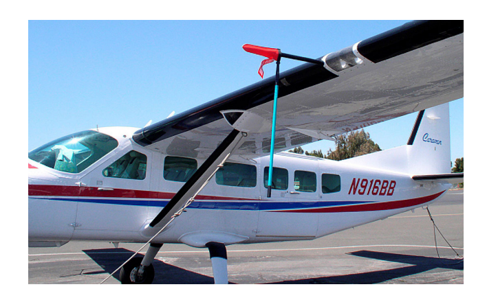
Cessna 208 Caravan Telescoping Pitot (for amphib. models)

Waco YMF-5 Pitot Tube Covers , NOT HEAT RESISTANT TYPE, are made of Naugahyde vinyl, and are designed to cover the entire pitot assembly. Slipping over the tube, the cover tightens around the base with a Velcro strap detail. A "Remove Before Flight" streamer is attached to the cover. Heat Resistant Pitot Covers are an upgrade to this design, and help prevent the pitot cover from melting onto the tube if the pitot heat is accidentally turned on while installed. If you want the set tethered together, please let us know.