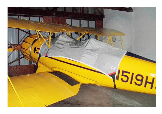
The Waco YMF Canopy Cover