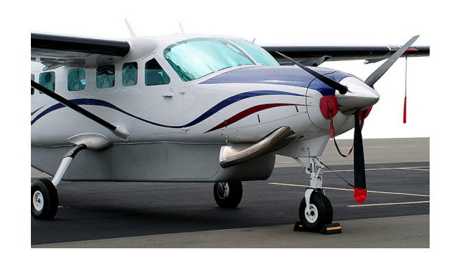
Cessna Caravan Windshield HeatShield, Plugs, Prop Ties & Pitot Cover