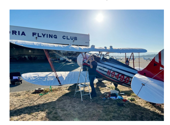
Waco YMF-5 Engine, Extended Canopy, Wing Covers & Horizontal Stab Covers

WINTER USE MATERIAL - Made with Solution-Dyed Polyester fabric, this option is intended for seasonal use to aid in deicing, rain mitigation, or for occasional travel. The material is lighter and more compact, but more susceptible to UV damage and may have a shorter useful life if used continuously outside than the all-year use material.