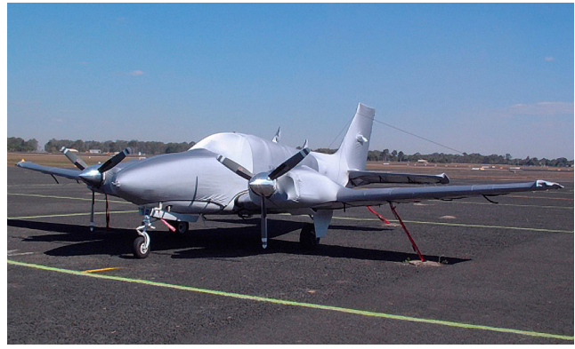
Baron FULL COVER SET, Light Weight Travel &/or Fitted Dust Cover Set