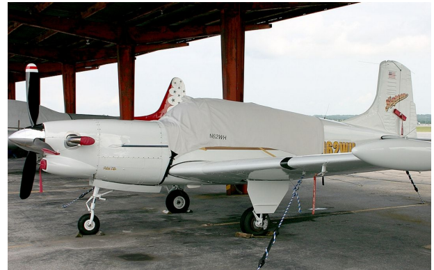
Beech Harpoon Canopy Cover, Exhaust Covers, Engine Plug