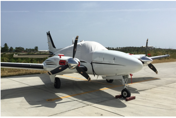
Baron 58 Canopy Cover, Engine Plugs