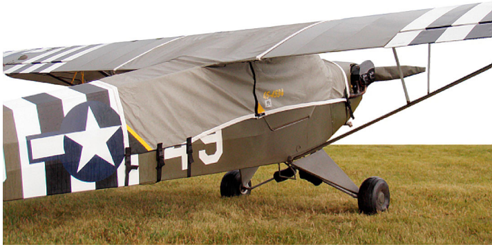
Piper J3 Extended Canopy Cover & Propellor Cover