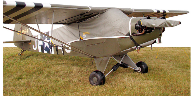
Piper J3 Extended Canopy Cover & Propellor Cover