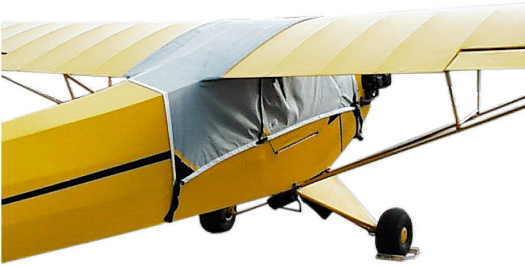
Piper J3 Over-Top Canopy Cover