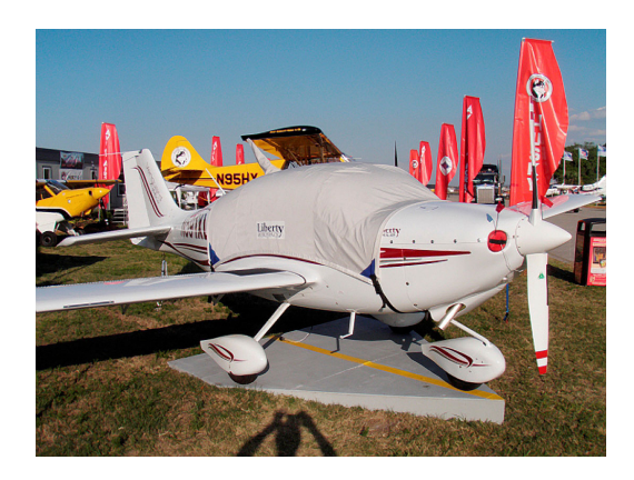
XL-2 Canopy Cover & Engine Plugs

This cover type is made from Silver Acrylic Sunbrella canvas and is 100% lined with a soft and smooth microfiber. Bruce's Custom Covers developed this material combination especially for aircraft protection. The outer material is medium weight and treated for water resistance, UV resistance and anti-static buildup. The inner lining is a very soft and smooth microfiber to prevent scratching. The material is very reflective, and tests show that the cabin interior temperature can be reduced to near-ambient temperature on the hottest of days. It is water, ice and snow repellent, yet breathable to allow moisture to escape from between the cover and the aircraft surface.