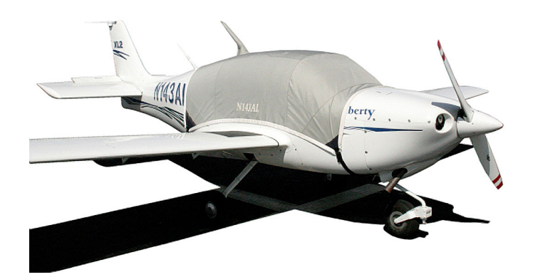
XL-2 Canopy Cover