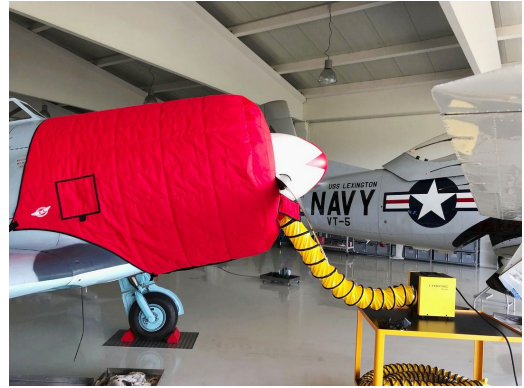
Yak 11 Insulated Engine Cover