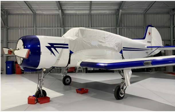
Yak 18T Canopy Cover