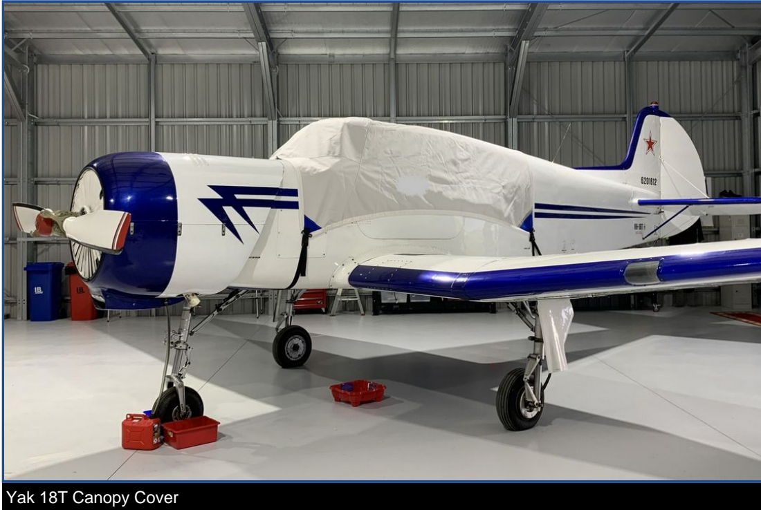
Yak 18T Canopy Cover