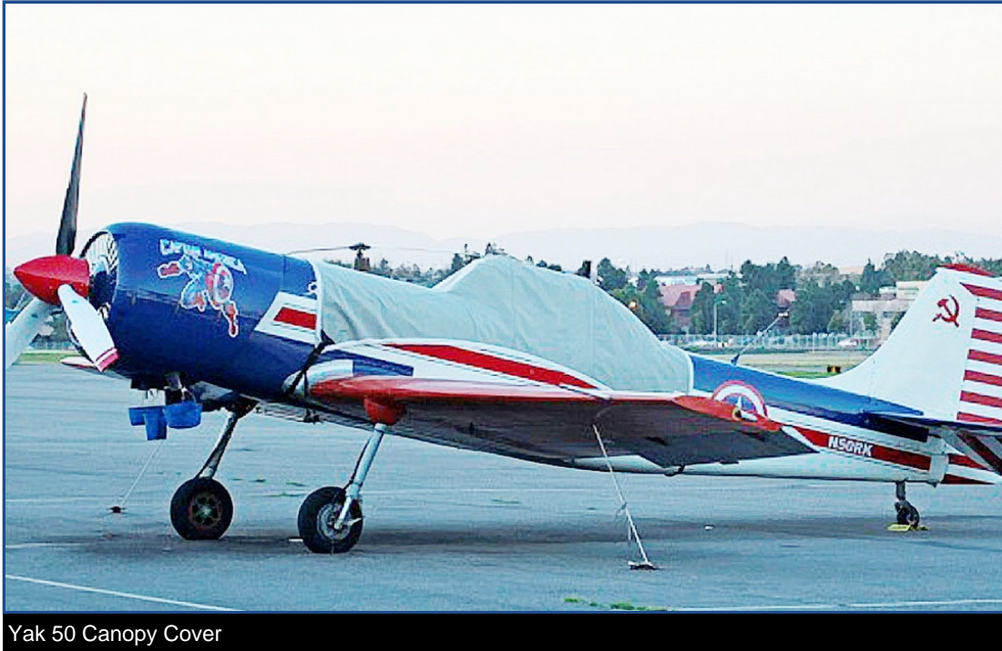
Yak 50 Canopy Cover