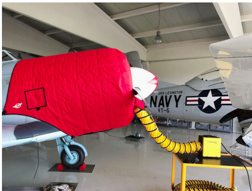
Yak 11 Insulated Engine Cover

This cover type is made from Silver Acrylic Sunbrella canvas and is 100% lined with a soft and smooth microfiber. Bruce's Custom Covers developed this material combination especially for aircraft protection. The outer material is medium weight and treated for water resistance, UV resistance and anti-static buildup. The inner lining is a very soft and smooth microfiber to prevent scratching. The material is very reflective, and tests show that the cabin interior temperature can be reduced to near-ambient temperature on the hottest of days. It is water, ice and snow repellent, yet breathable to allow moisture to escape from between the cover and the aircraft surface.