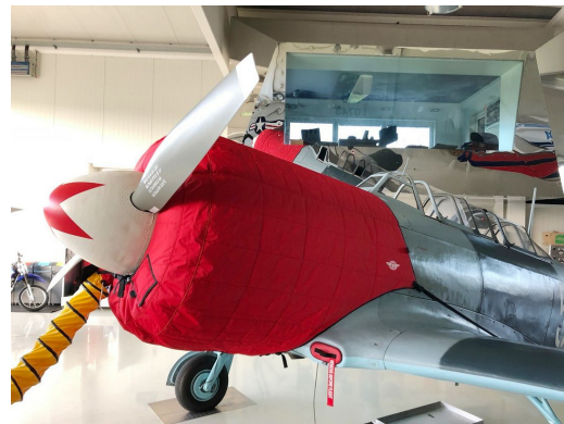
Yak 11 Insulated Engine Cover & Oil Cooler Inlet Plug