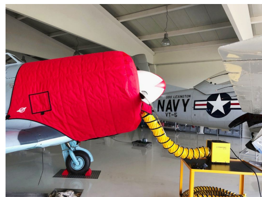
Yak 11 Insulated Engine Cover

This cover type is made from Silver Acrylic Sunbrella canvas and is 100% lined with a soft and smooth microfiber. Bruce's Custom Covers developed this material combination especially for aircraft protection. The outer material is medium weight and treated for water resistance, UV resistance and anti-static buildup. The inner lining is a very soft and smooth microfiber to prevent scratching. The material is very reflective, and tests show that the cabin interior temperature can be reduced to near-ambient temperature on the hottest of days. It is water, ice and snow repellent, yet breathable to allow moisture to escape from between the cover and the aircraft surface.