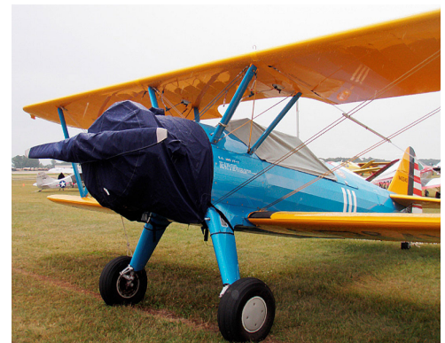
Stearman Canopy, Engine & Prop Covers