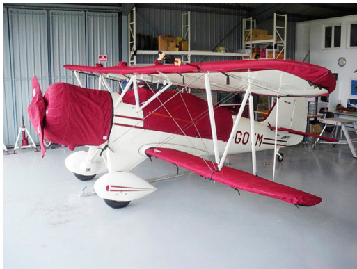
Waco UPF-7 Canopy, Wings, Stab's, Engine, Prop Covers

This cover type is made from Silver Acrylic Sunbrella canvas and is 100% lined with a soft and smooth microfiber. Bruce's Custom Covers developed this material combination especially for aircraft protection. The outer material is medium weight and treated for water resistance, UV resistance and anti-static buildup. The inner lining is a very soft and smooth microfiber to prevent scratching. The material is very reflective, and tests show that the cabin interior temperature can be reduced to near-ambient temperature on the hottest of days. It is water, ice and snow repellent, yet breathable to allow moisture to escape from between the cover and the aircraft surface.