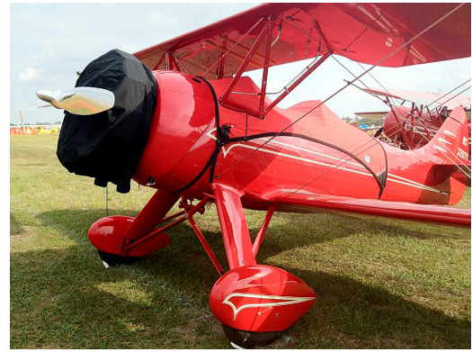
Waco UPF-7 Canopy & Engine Cover