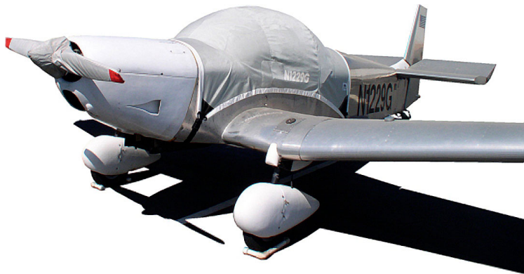
Zenith CH601 Canopy Cover & Prop Cover

This cover type is made from Silver Acrylic Sunbrella canvas and is 100% lined with a soft and smooth microfiber. Bruce's Custom Covers developed this material combination especially for aircraft protection. The outer material is medium weight and treated for water resistance, UV resistance and anti-static buildup. The inner lining is a very soft and smooth microfiber to prevent scratching. The material is very reflective, and tests show that the cabin interior temperature can be reduced to near-ambient temperature on the hottest of days. It is water, ice and snow repellent, yet breathable to allow moisture to escape from between the cover and the aircraft surface.