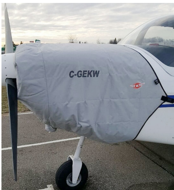
Zenith CH-2000 Insulated Engine Cover