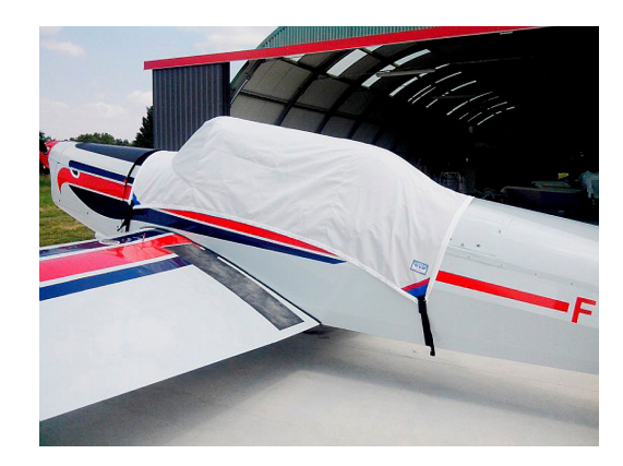
Zlin 326 Travel Cover